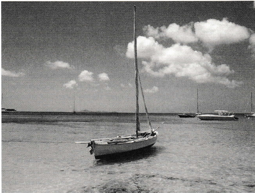
Photo 1 An anchored whaling boat at the Britannia Bay, Mustique (2005)

Meanwhile, a lookout and helpers remain on a hill back in Bequia, scanning for whales through binoculars. When one is spotted, they inform the crewmen on Mustique using marine radios (or cell phones since 2003) (see Hamaguchi 2011: 226–227). The whaling boats then start to pursue the whale. If they catch the whale, they tow it to the shore station in Petit Nevis (or in Semple Cay since 2005) with the help of a fishing boat with an outboard engine, where it is processed (see Hamaguchi 2011: 230–232). This